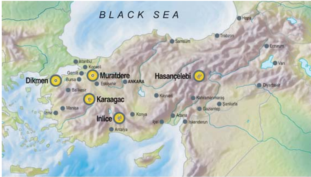
Location of Stratex projects in Turkey

Altintepe (not shown) is located between Samsun and Trabzon close to the Black Sea Coast.